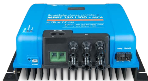
Solar Charge Controller MPPT 150/100-MC4 without display